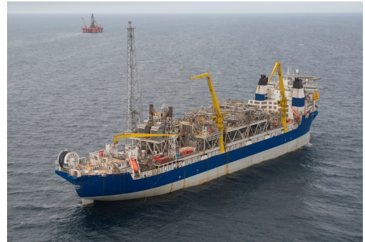
Alvheim FPSO Norway