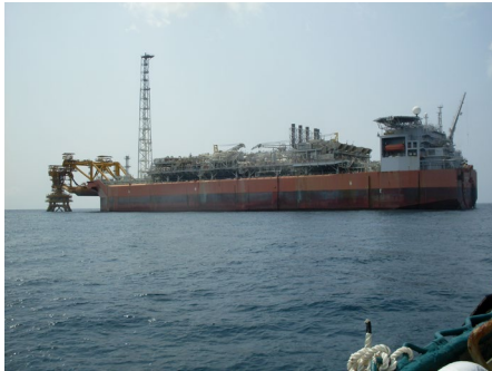
Sea Eagle FPSO, Shell Nigeria