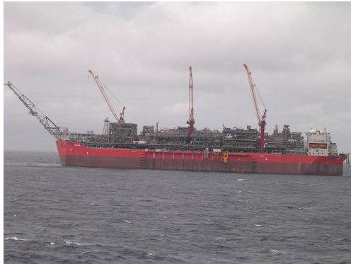
Bonga FPSO. Shell Nigeria