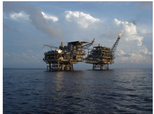
Premier Oil Indonesia